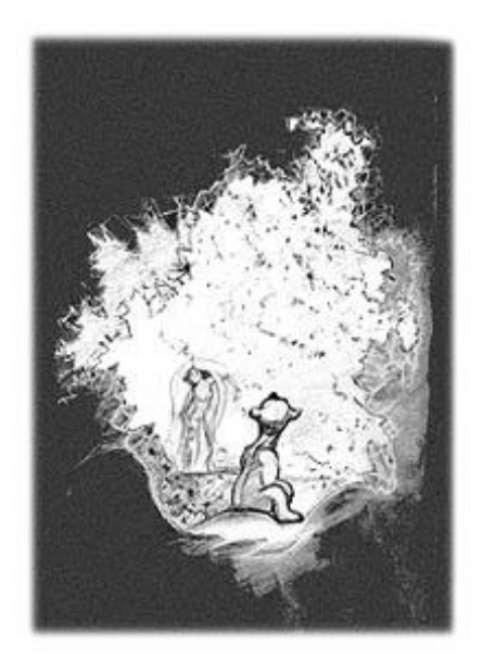
"Oh," says the Little She-Bear. "You are beautiful!"

"Oh," says the Little-Bear cub. "They are missing so much, they are such beautiful songs." And then very suddenly he sees something just out of the corner of his eye and he turns around swiftly and looks and there standing near them is a beautiful, wondrous creature all shining bright, another two-legs only different from the Great Shaman. This two-legs has pointed ears and long white hair all the way down to the feets, and has a beautiful slim shape, and where the Great Shaman has big, strong chest, this one has small chest with poky things sticking out. And down the body is beautiful slim shape with a garment of gossamer, bright, shining, covering the body, so delicate, so light and there, as though there is a little breeze blowing and the hair is lifting off the face which has a very mischievous and pointed look to it.